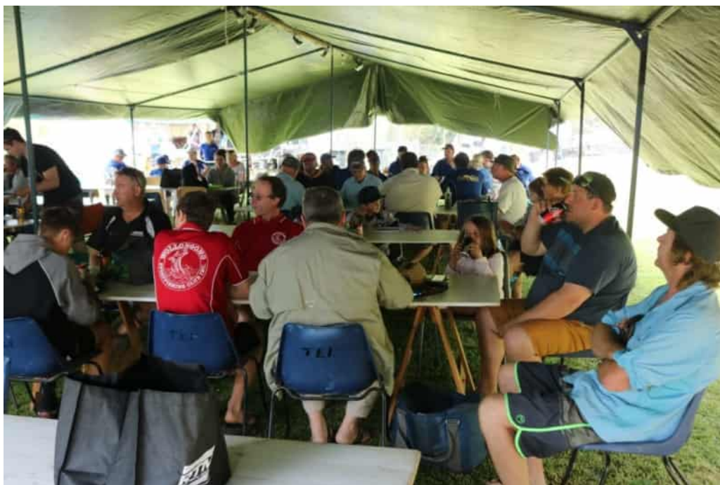
Sunday lunch at Burrinjuck.

I will admit I've definitely got a soft spot for our own Convention. After all, the Burrinjuck Convention introduced me to many members from the other ANSA Clubs, and enjoyment of fishing the Convention Circuit And what's not to like about the King Parrots that fly in to Lawlers to supervise the setting up and packing up of the Convention HQ?