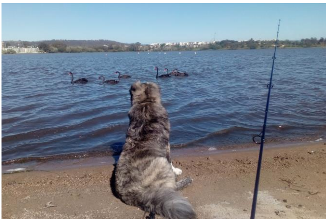
Mel Marlborough: Fish are quiet and the swans don't want to play 😞