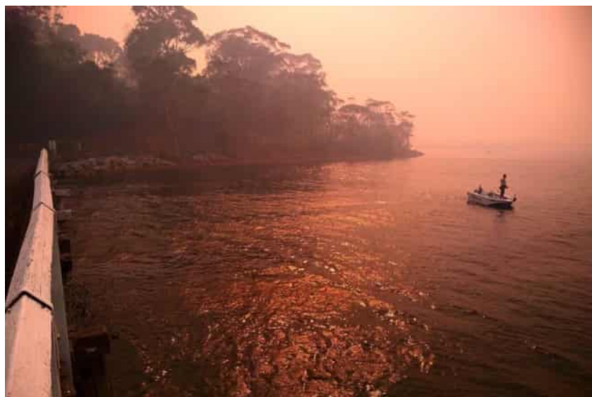
Jon Vogel: Pre-smoked fish at Wallaga Lake