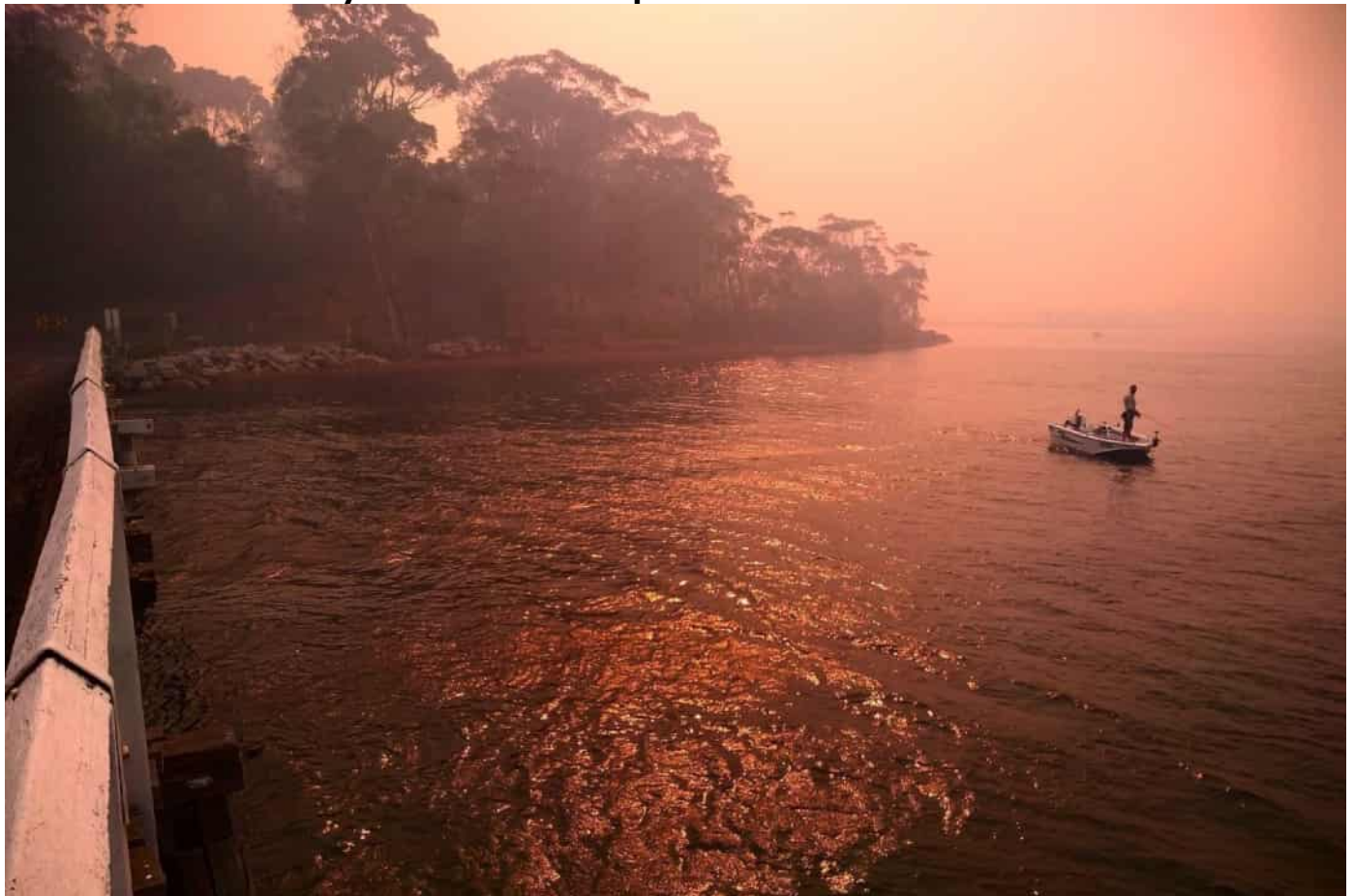
Jon Vogel: Pre-smoked fish at Wallaga Lake