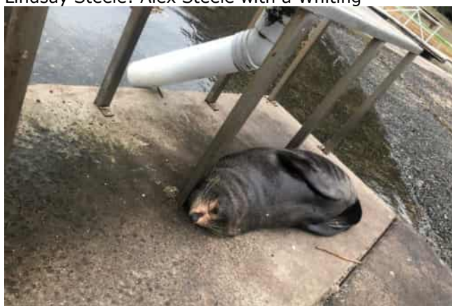
Glen Malam: Lazy seal waiting for fish to drop down