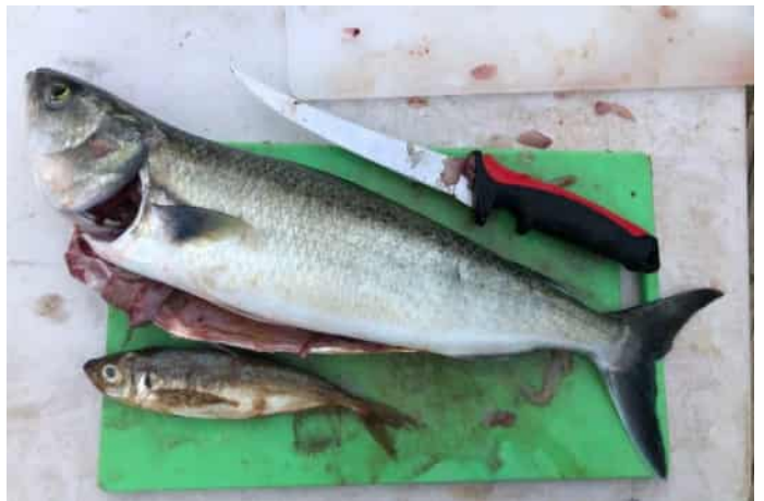
My best fish for the evening was a 53 cm 1.61 kg Salmon on 2 kg line. No doubt the whole yakka inside its stomach contributed to some valuable ANSA points for the 12-month comp!