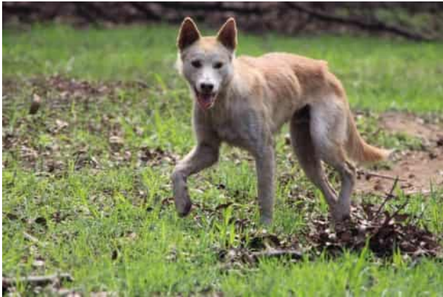
Dingo says hello on the way to the ANSA Nowra Convention