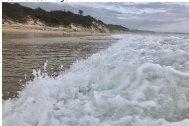
Anthony Heiser: Fishing Bhewerre Beach at the ANSA Nowra Convention