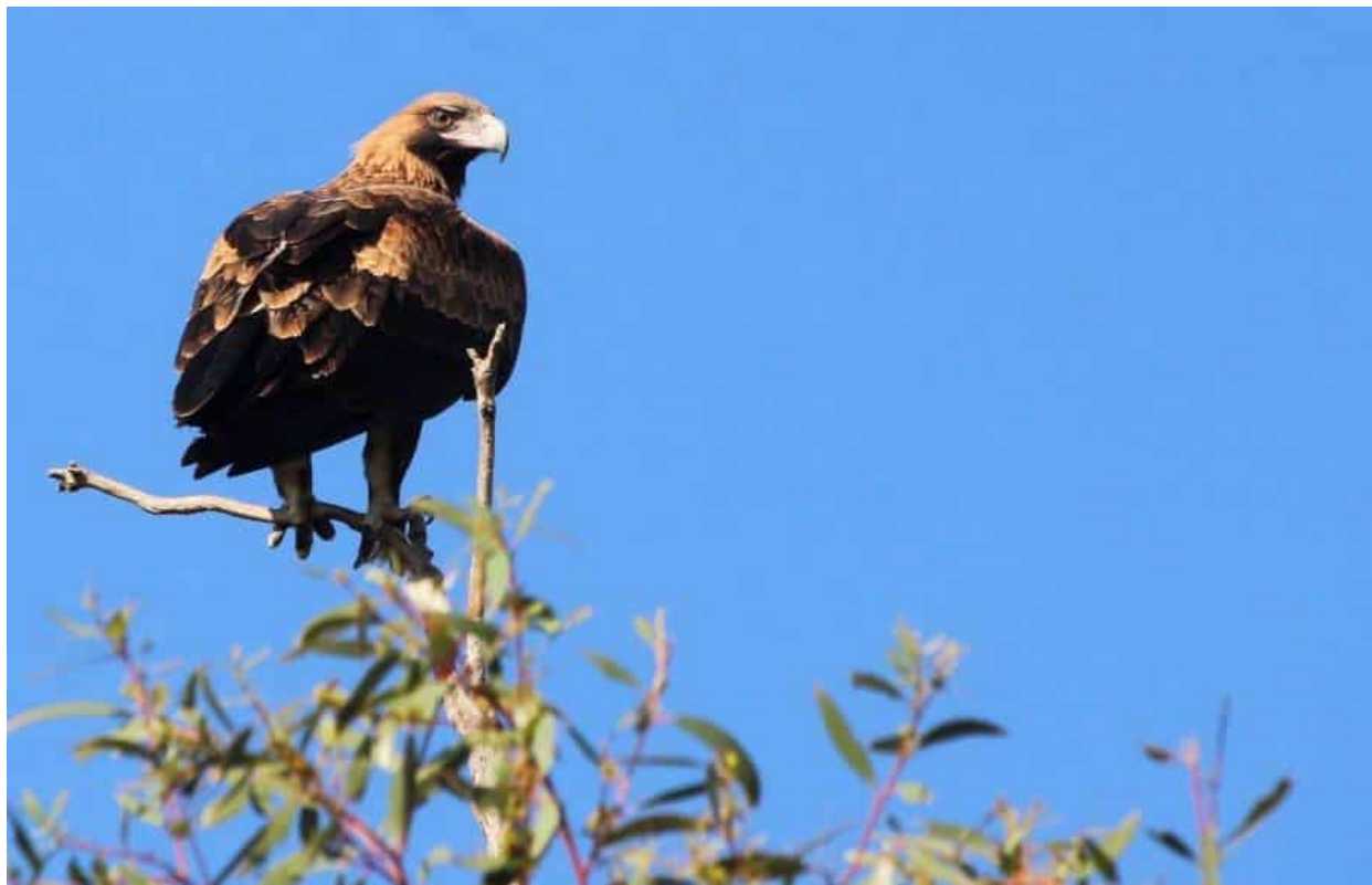
Wedgetail Eagle I spotted on the drive to the coast no doubt gave me good luck on the beach that day.