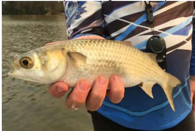
Chris Lemmon: 0.66 kg Bully Mullet on a Sugapen near Tuross Bridge.